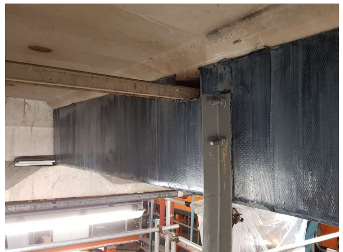
Elevation of Typical Carbon Fibre Strengthening Reinforcement around Existing Penetrations