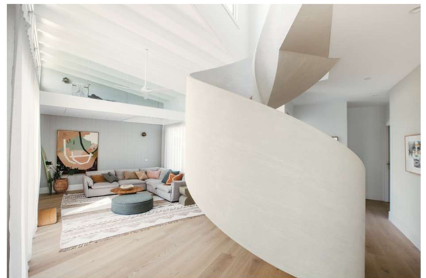
Example of an residential application*