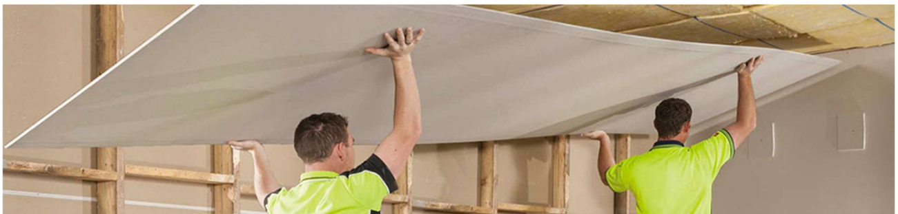
Example of an internal ceiling installation*